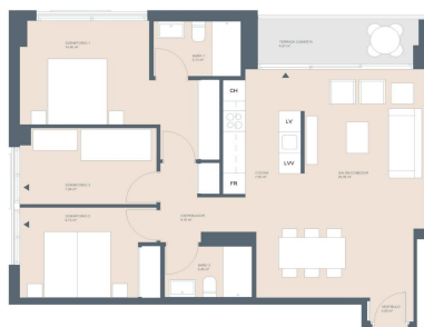
Bloque 4 Portal 7 P01-D