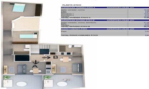
Áticos Estudio B y Vivienda A